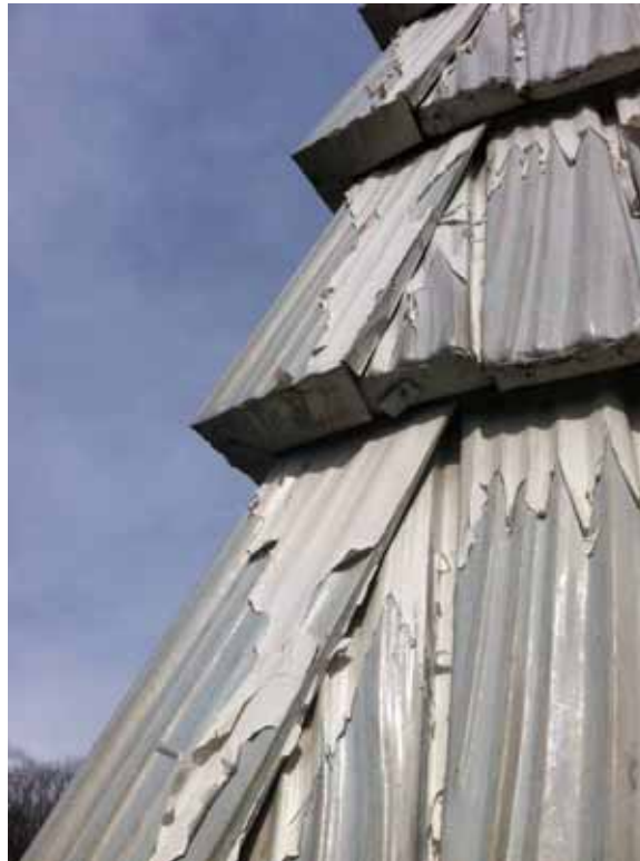
Close-up of the aluminum siding at the corner of Building A. Note the extensive peeled paint and loosely joined corner pieces.