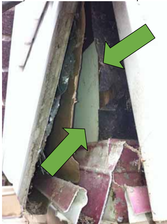
View of inconsistent, non-continuous underlayment material behind siding of Building E.