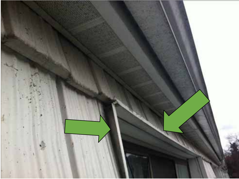
Existing windows are encapsulated in aluminum sheet metal 'box' style trim. Note the sagging header above the window, trim not flush at jambs.