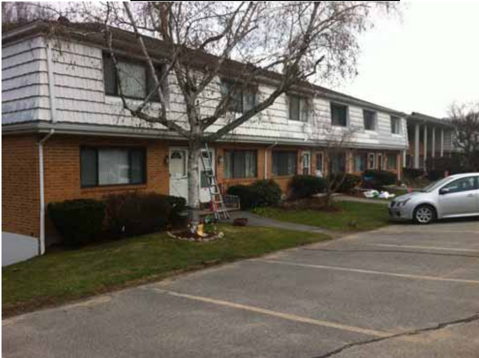
Partial view of Building A located on the Farrwood 2 property.