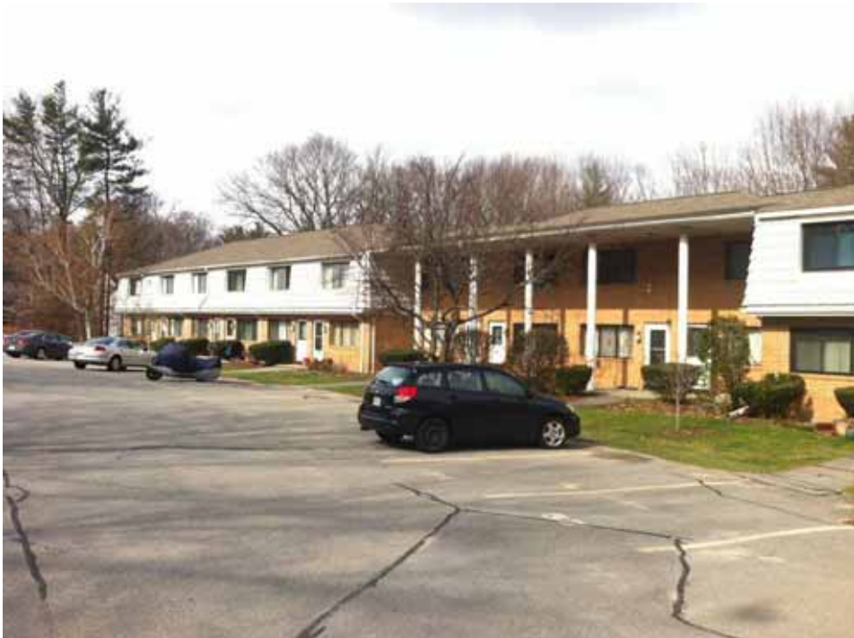
Additional view of the building's exterior components.