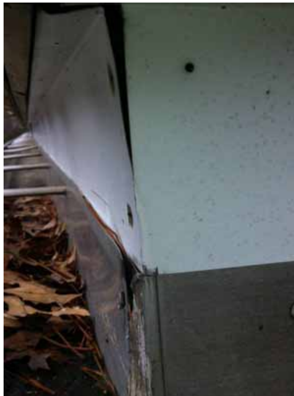
Partially open sheet metal apron flashing corner above gutter of Building C.