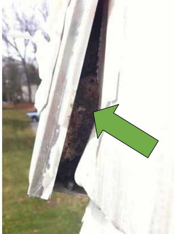
View of old bee hives tucked behind the open siding at the corner of Building B.