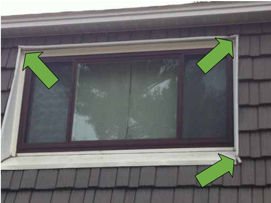
Box out trim installed around windows is dented/contains poorly fabricated corners.