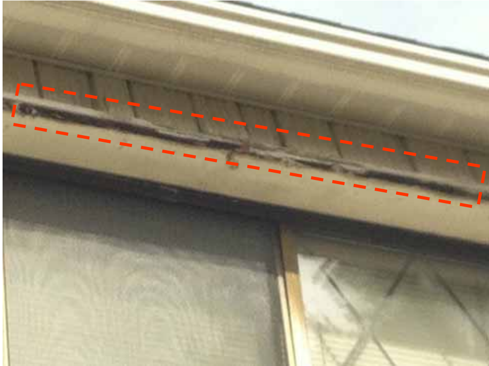
View of wood board spanning along the head of one window. Sheet metal behind it is damaged and an attempt was made to seal between lumber and box metal.