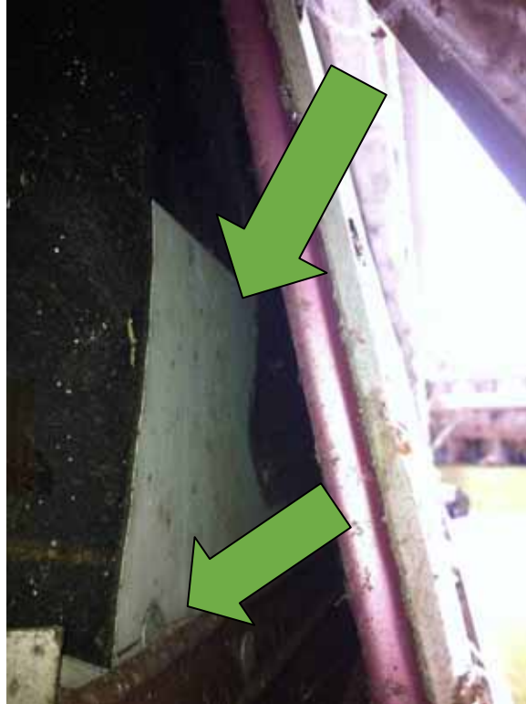
View behind the siding showing a partial piece of sheet metal fastened into the substrate. Tar paper underlayment was not continuous at this particular corner.